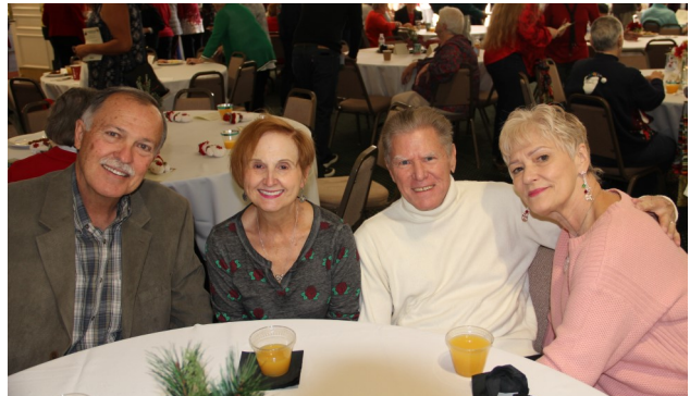
Guests at Festival of Trees on Nov. 23, 2019