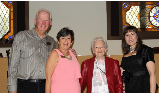
Honorees at Tribute to Traditions May 21, 2019